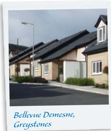
Bellevue Demesne, Greystones