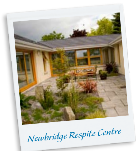
Newbridge Respite Centre

The centre is fully wheelchair accessible and has five large studio bedrooms. All have en-suite and kitchen facilities and double doors which lead out to a paved patio and garden area. The rooms are also fitted with overhead hoists and comprehensive assistive technology. Three carer bedrooms were included in the design so respite users could have a family member or P.A. accompany them during their stay if they wished.