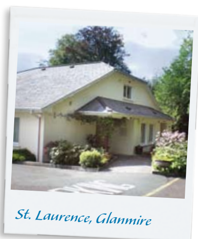
St. Laurence, Glanmire

A Department of the Environment Capital Assistance Scheme Grant was approved for €2,193,451 and €350,000 of HSE capital funding was allocated in 2008. The Local Committee at St. Laurence has also engaged in a major fundraising initiative in order to provide for the fit-out of each apartment.